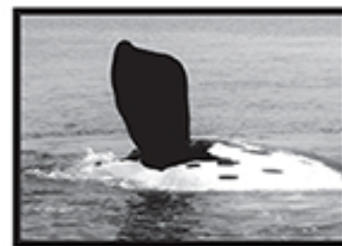
Blunt Shaped Flippers