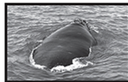
No Dorsal Fin