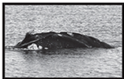
White Markings on Head