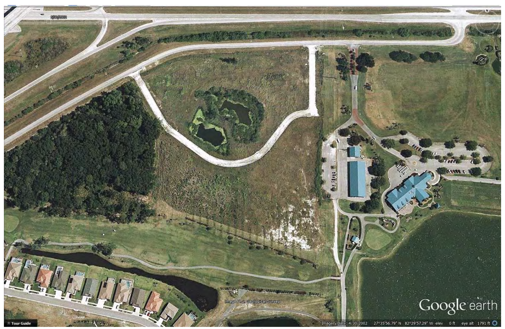
Figure 3. 1998 aerial, showing site conversion from citrus to residential (infrastructure).