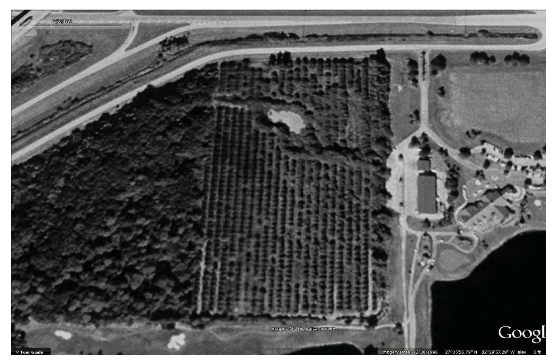
Figure 2. 1998 aerial, showing site conversion to citrus with upland-cut irrigation pond.