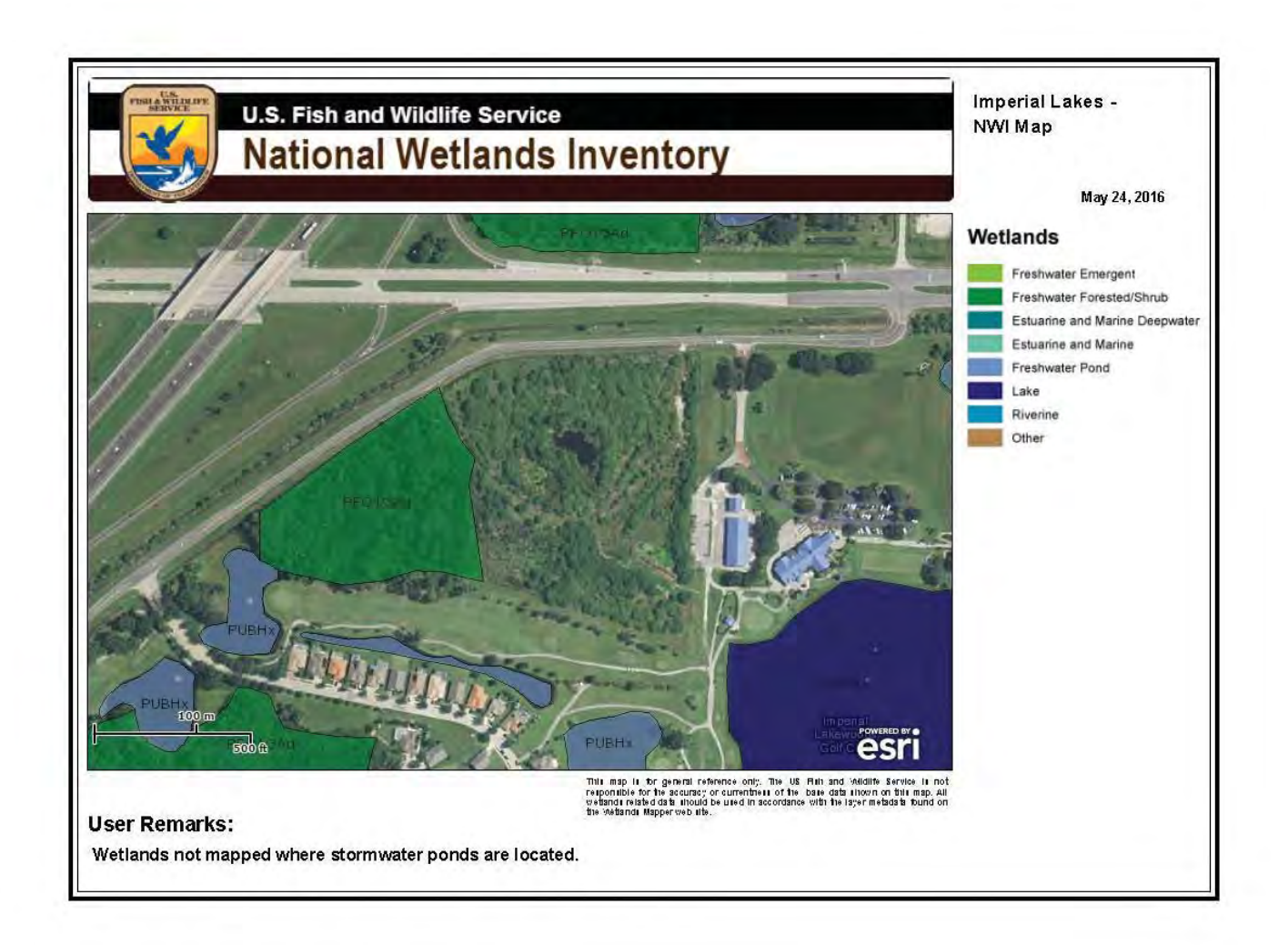
Figure 5. USFWS - NWI Map of site.