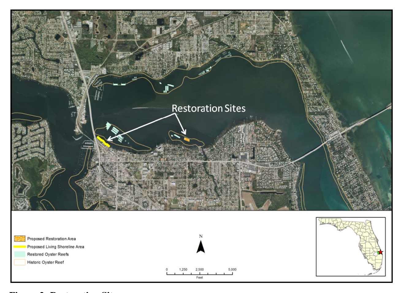
Figure 2: Restoration Sites