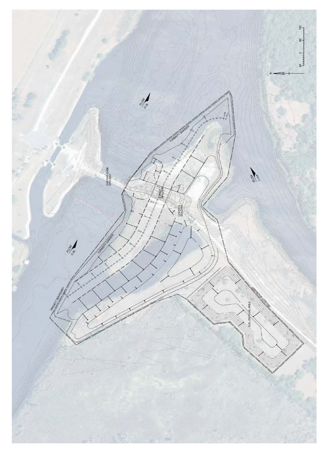
Figure 2.3. Project Site Plan Including Location of New Structure And New Channel Alignment.