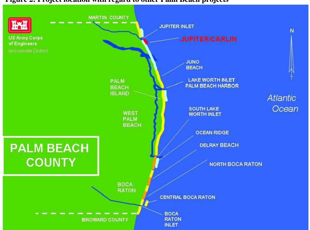
Figure 2: Project location with regard to other Palm Beach projects