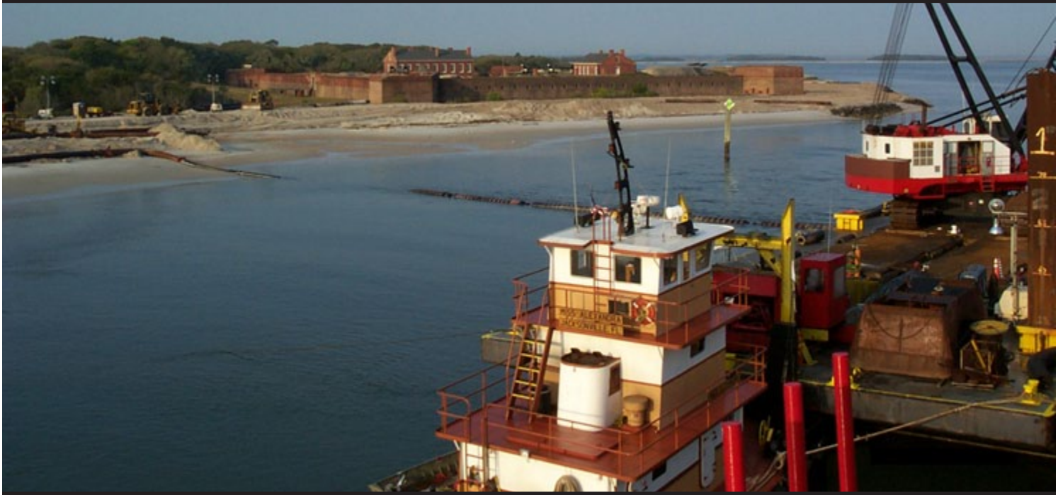
Sand was placed at Fort Clinch State Park following the dredging of Kings Bay Entrance Channel at Fernandina Harbor.

Florida's shorelines saw a flurry of activity during 2012. The state experienced several storm systems that caused erosion impacts to a host of federal beach projects. In addition, a few beaches saw new sand placed on their shores as a result of U.S. Army Corps of Engineers' dredging projects.