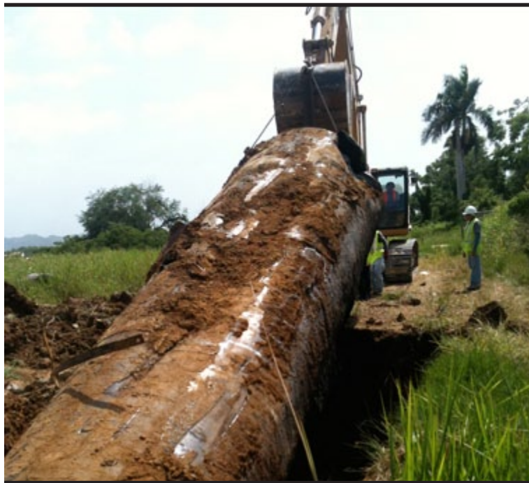
Approximately 11,000 lineal feet of pipeline and 10 underground storage tanks were removed from the former Arecibo Airdrome in Puerto Rico. (USACE PHOTO)

"Although we had complications and challenges, we got the work done on time and within budget," Araico said. ♦