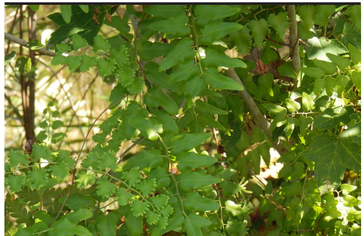
Old World climbing fern, a perennial that can reach lengths of more than 90 feet, invades swamps, glades and hammocks.

The control paper will explore options and technologies that could be applied to prevent aquatic nuisance species transfer through aquatic pathways between the Great Lakes and Mississippi River basins. Recently the team began a risk assessment process to test the technologies proposed in the control paper. The proposed technological controls will be presented to Congress by January 2014. ♦