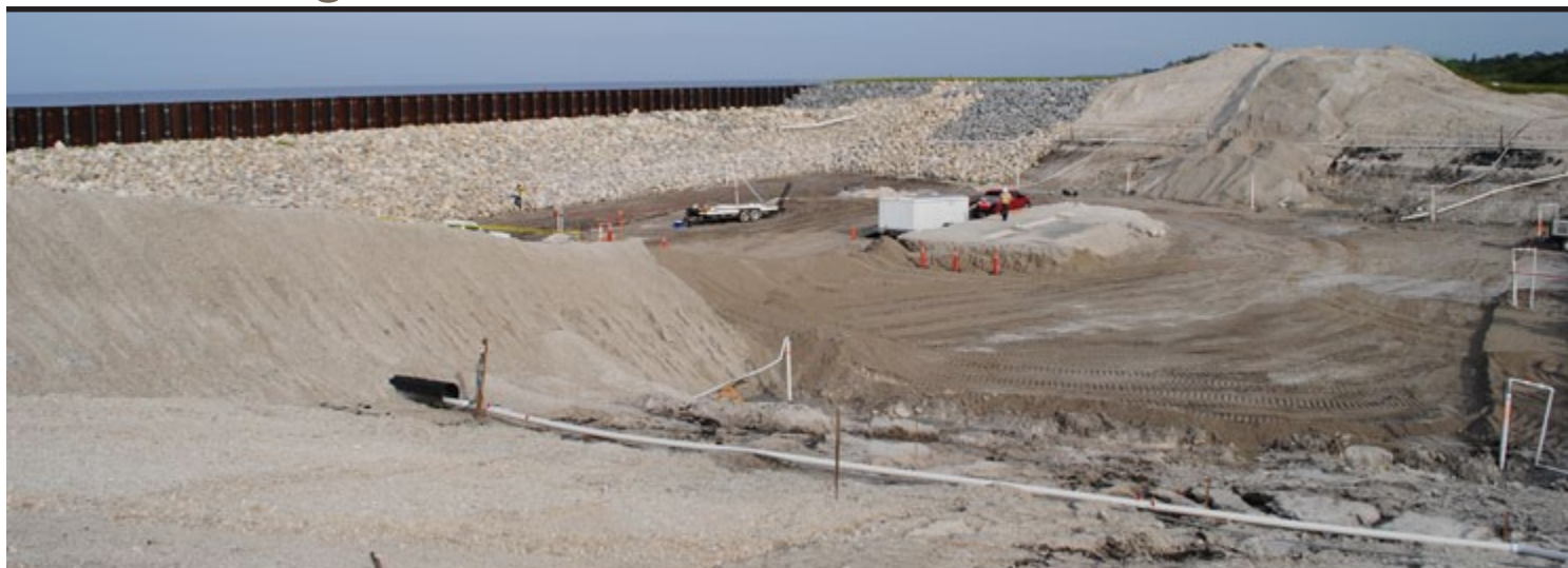
Work continues at the Culvert 11 site near Port Mayaca to replace a water control structure in Herbert Hoover Dike. Thirty-two structures, dating back to the 1930s, are scheduled to be removed, replaced or abandoned.

The past year saw both low water and high water at Lake Okeechobee, as well as completion of one project and the start of others on Herbert Hoover Dike (HHD).