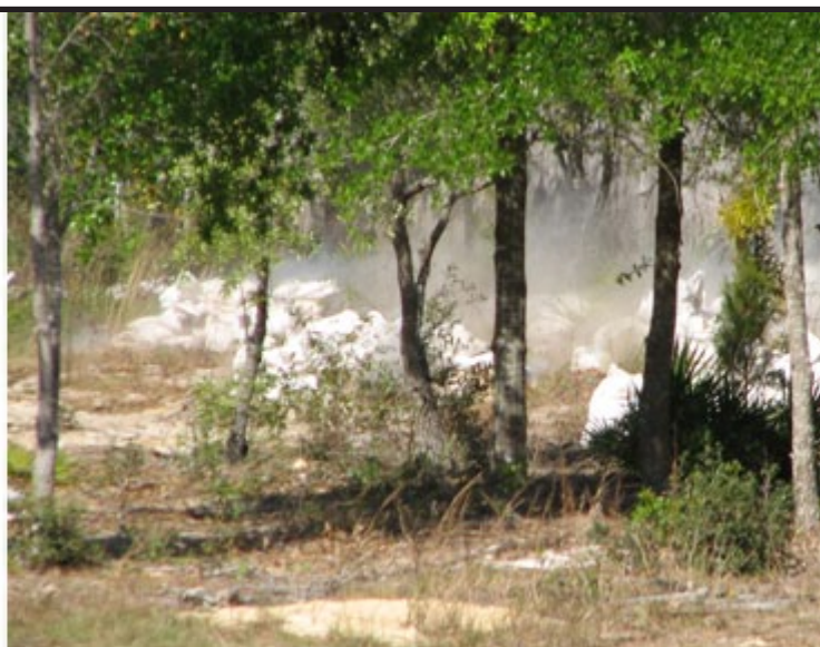
Left photo - workers prepare for a "blow-in-place" detonation of munitions discovered at Brooksville Turret Gunnery Range; Right photo - dust rises following the detonation. This work is done by trained professionals; the Corps adds a caution to the public that if suspected munitions are found, follow the 3Rs of explosives safety: RECOGNIZE the item may be dangerous; RETREAT without touching or moving the object; and REPORT its location to local law enforcement.