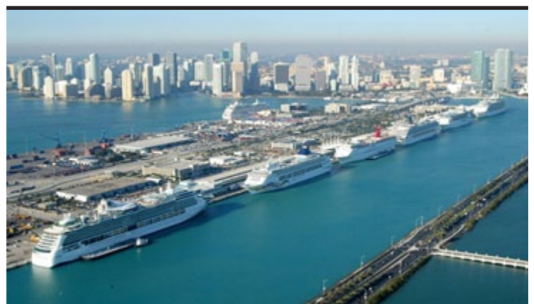
The Port of Miami, one of two Jacksonville District projects included in the administration's "We Can't Wait" initiative, welcomed four million cruise passengers last year and anticipates doubling its cargo traffic over the next decade. A contract award for the project is anticipated in March 2013.

The Miami Harbor project is well under way and is moving full steam ahead. A permit for the project was issued in August and the project was advertised in October. The contract award is anticipated in March 2013. ♦