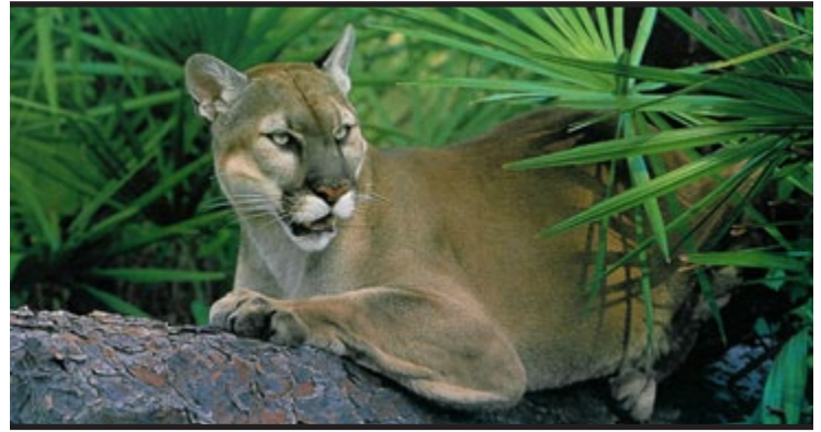
A unique collaboration between federal, state and private organizations preserved the single most important area in Florida for ensuring the natural recovery of Florida panthers.

Through the collaborative efforts of numerous federal, state and private organizations, the 1,278-acre American Prime property in Glades County, a property described as a "keystone tract" in the single most important area in the state for ensuring the natural recovery of Florida panthers, was purchased by The Nature Conservancy May 16.