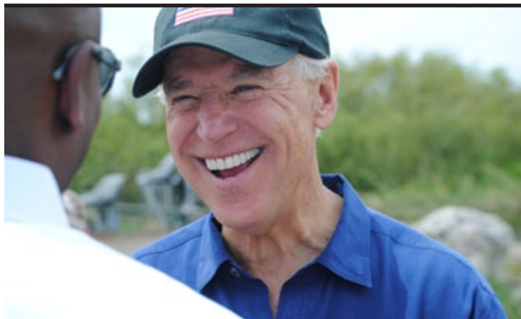
Vice President Joe Biden visited the Everglades in April, to discuss the administration's ecosystem restoration priorities and efforts.

"About a mile from here, we're building a bridge to raise up the Tamiami Trail so there can be a natural flow of water," Biden said.