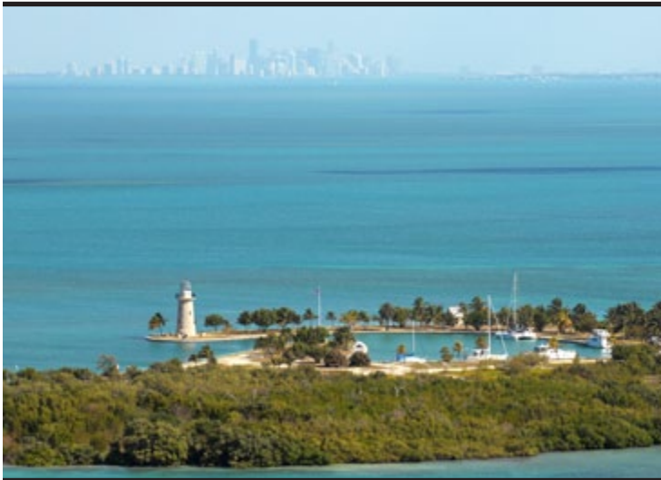
The Biscayne Bay Coastal Wetlands Phase 1 Project achieved a signed Record of Decision in 2012. The project is essential to achieving restoration of tidal wetlands and nearshore habitats within Biscayne Bay, including Biscayne Bay National Park.