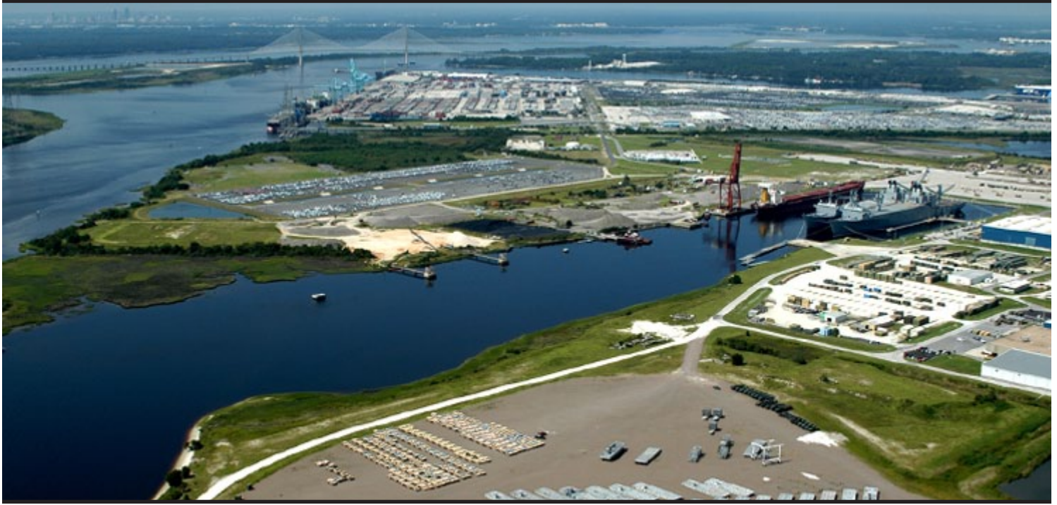
The Jacksonville Harbor Deepening Study, included in President Obama's "We Can't Wait" Initiative, is being conducted on an expedited schedule. The Jacksonville Harbor (Mile Point) Navigational Study achieved a signed Chief of Engineers' Report and Project Design Agreement, critical steps in moving the project to Congressional authorization and appropriation.

Ports were thrust into the national spotlight in 2012 after President Obama announced the "We Can't Wait" Initiative, which placed several of Jacksonville District's port projects and studies onto the fast track for implementation.