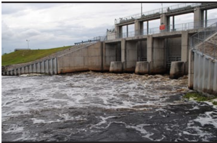
Water flows through the gates of the Moore Haven Lock in October, as Jacksonville District started discharges from Lake Okeechobee to stem the rapid rise in lake levels after Tropical Storm Isaac. The releases began Sept. 19 and continued until early November.

later, the district increased the releases to 4,000 cubic feet per second (cfs) at the Moore Haven Lock and 1,800 cfs at the St. Lucie Lock. In early November, as the lake water level started to decline again, the releases were suspended to the St. Lucie Estuary, but were continued for environmental reasons in the Caloosahatchee.