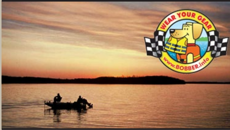
Fishing at sunset on Lake Okeechobee.

Recreation and water safety are important, ongoing missions for the U.S. Army Corps of Engineers (USACE), the nation's leading provider of outdoor recreation. USACE has more than 420 lake and river projects in 43 states that attract nearly 370 million visitors each year.