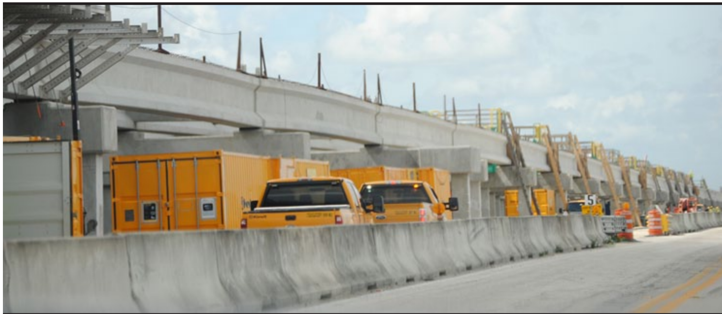
Construction of the $81 million Tamiami Trail project began in 2010, with the first concrete pour on the bridge deck taking place in July 2012. A one-mile bridge and 9.7 miles of raised and reinforced road will allow increased water flows essential to the health and viability of the Everglades.

For Everglades restoration, the year started off with lots of excitement and momentum as the Central Everglades Planning Project (CEPP) accelerated, with the ambitious goal of delivering – within two years – finalized plans for congressional authorization for a suite of restoration projects in the central Everglades.