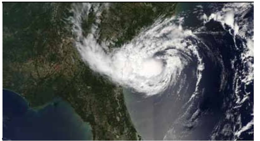
GE 5) Tropical Storm Alberto off the Georgia