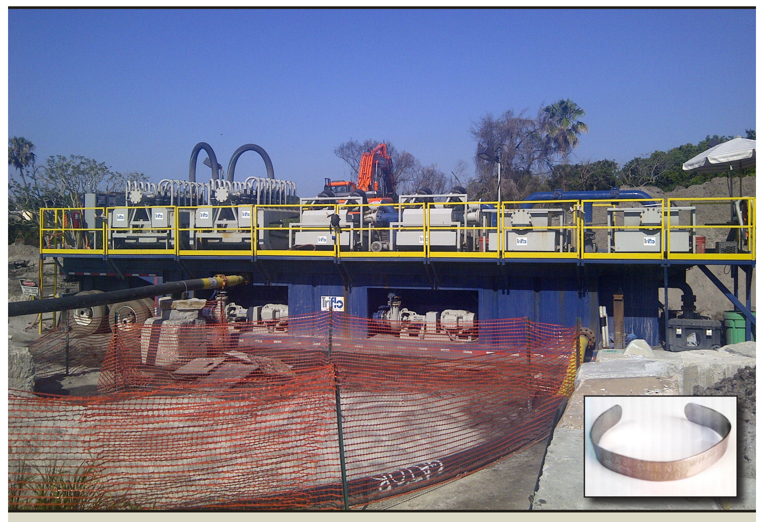
Employees of Army Corps of Engineers contractor Gator Dredging of Clearwater, Florida, discovered a prisoner of war bracelet, pictured at right, during dredging operations at Stevenson Creek and returned the bracelet to the late officer's family.