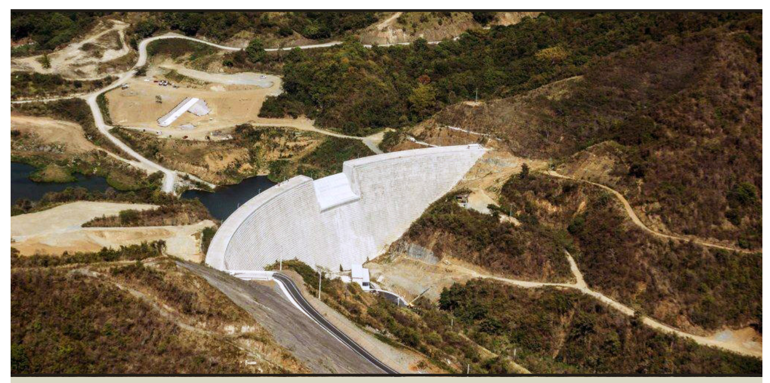
Portugués Dam in Ponce in southern Puerto Rico was dedicated in February 2014. Jacksonville District closed outlets on the 220-foot structure in mid-June to begin filling the reservoir.

After dedicating the structure in February 2014, the U.S. Army Corps of Engineers, Jacksonville District began the initial filling of the reservoir at Portugués Dam in southern Puerto Rico.