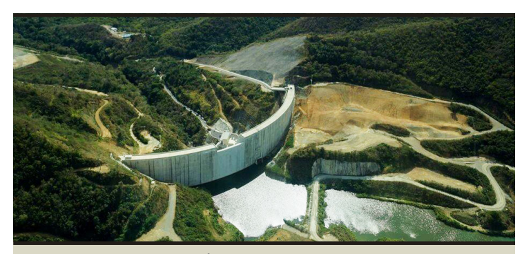
The backside of Portugués Dam as water begins to collect in the reservoir. Initial filling began on June 16 with a level of 372 feet, and will continue until it reaches 439.8 feet, its maximum normal operating level.

The dam also represents the final component of the Portugués and Bucana River flood risk reduction project. That project included construction of two dams, Portugués and Cerillos, and improvements in stormwater channelization structures throughout the city. Cerillos Dam was completed in 1991 and the channelization structures were finished in 1997. ◆