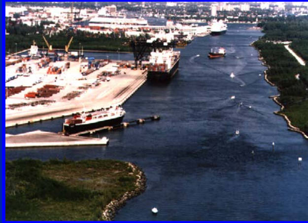
Port Everglades Har

Broward County is seeking reimbursement for construction of the Southport Channel and Turning Notch, constructed to a depth of 42 feet. Reimbursement approved for 39 feet which is the NED Plan. PCA executed in June 2004.