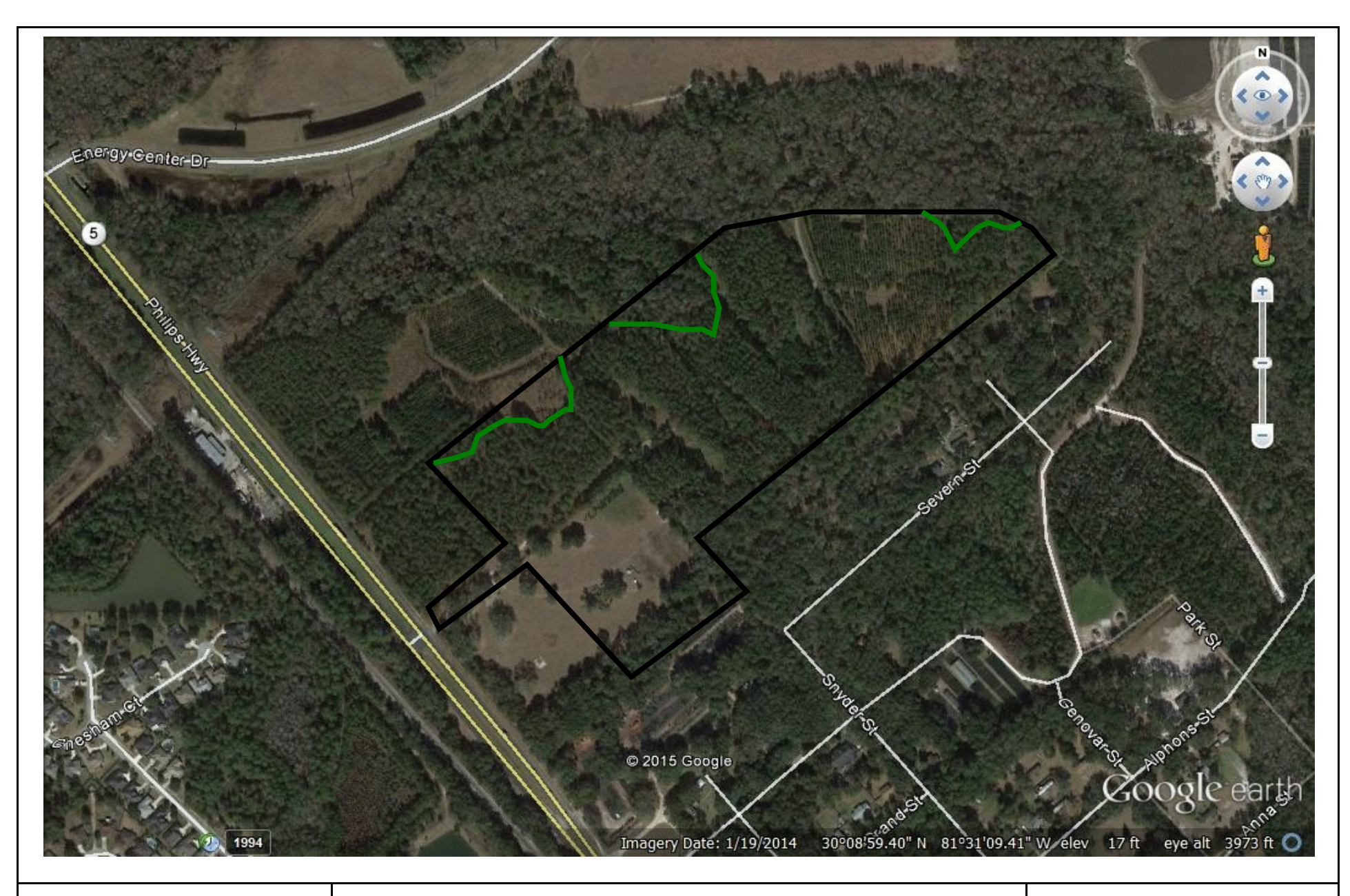
FIGURE 5. 2014 AERIAL PHOTO SHOWING APPROXIMATE WETLAND LINES

Davis Creek Forest, LLC 40.0± Acre Site Jacksonville, Florida