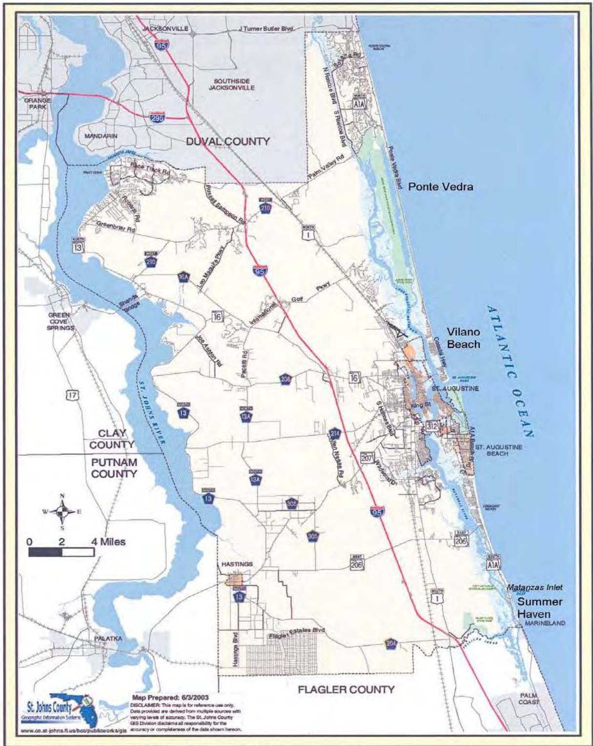
Figure 1 - St. Johns County Study Area Map