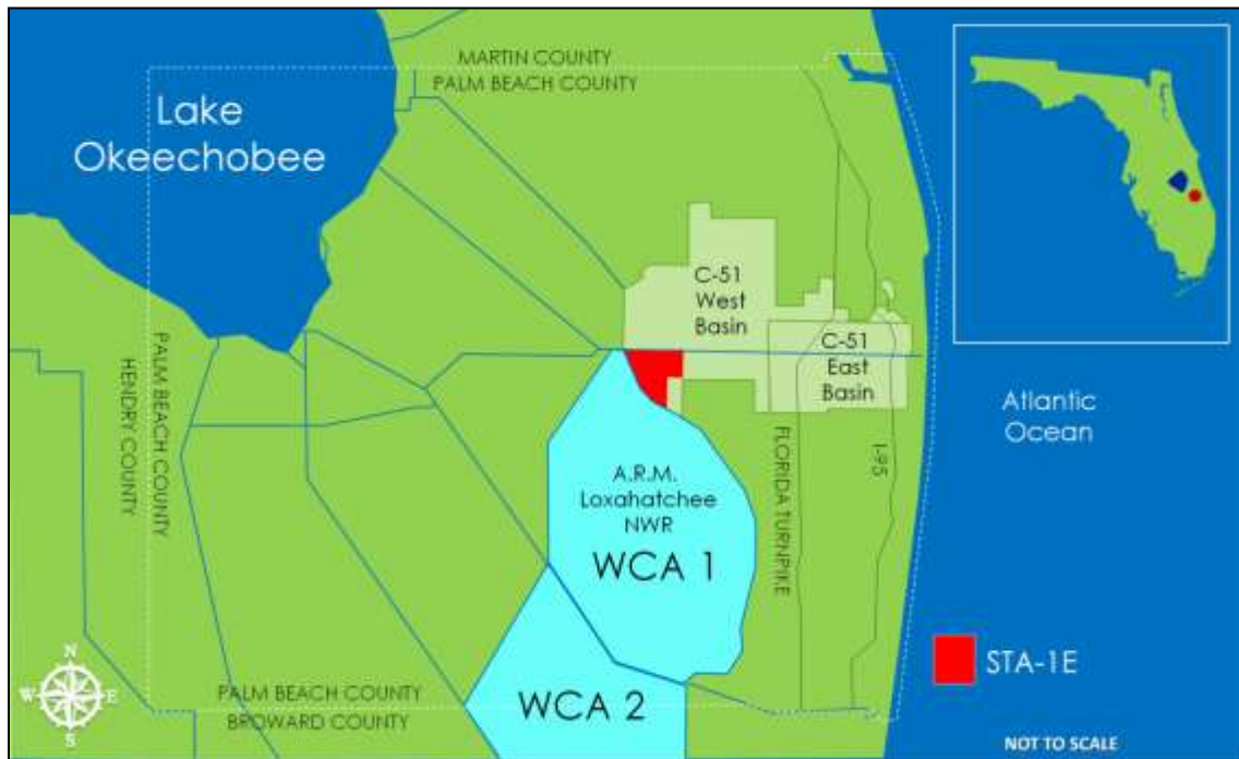
Figure 1: C-51 Basin and Project Area.

The C-51 canal is a component of the Central and Southern Florida Project ( Figure 1 ). The C-51 basin (East and West) is located in Palm Beach County, Florida and extends from the edge of WCA-1 on the west almost to the Atlantic Ocean on the east ( Figure 1 ). The drainage area of the basin is approximately 164 square miles. STA-1E is between WCA-1 and the C-51 canal, near the western end of the C-51 canal ( Figure 2 ).