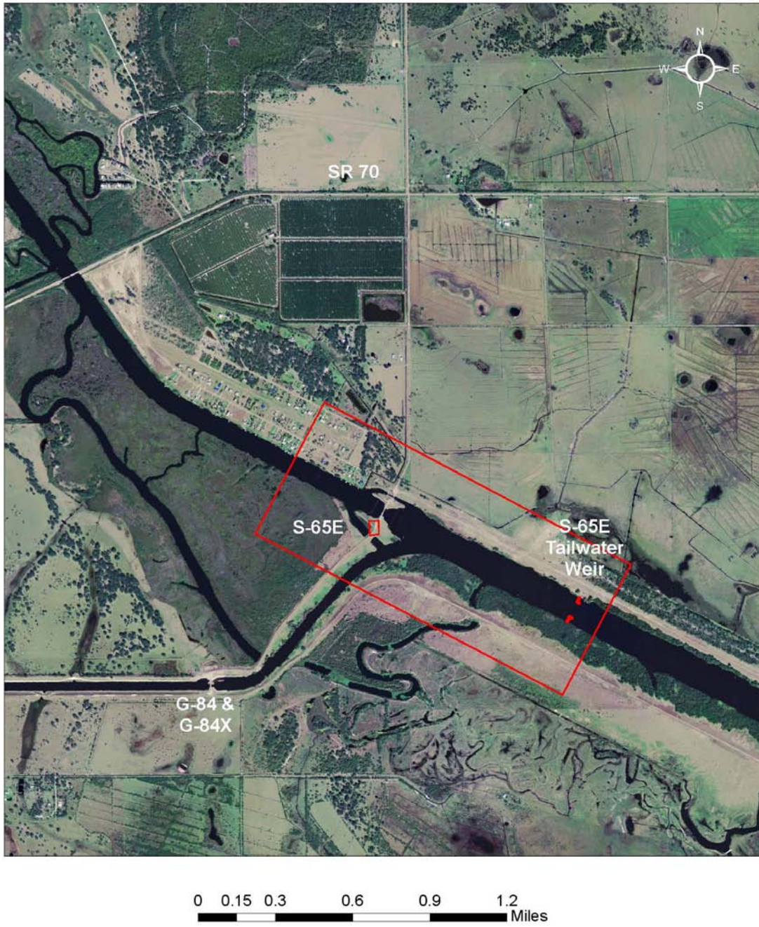
Figure 2.2 S-65E Spillway Addition Project Site Including Surrounding Structural Features