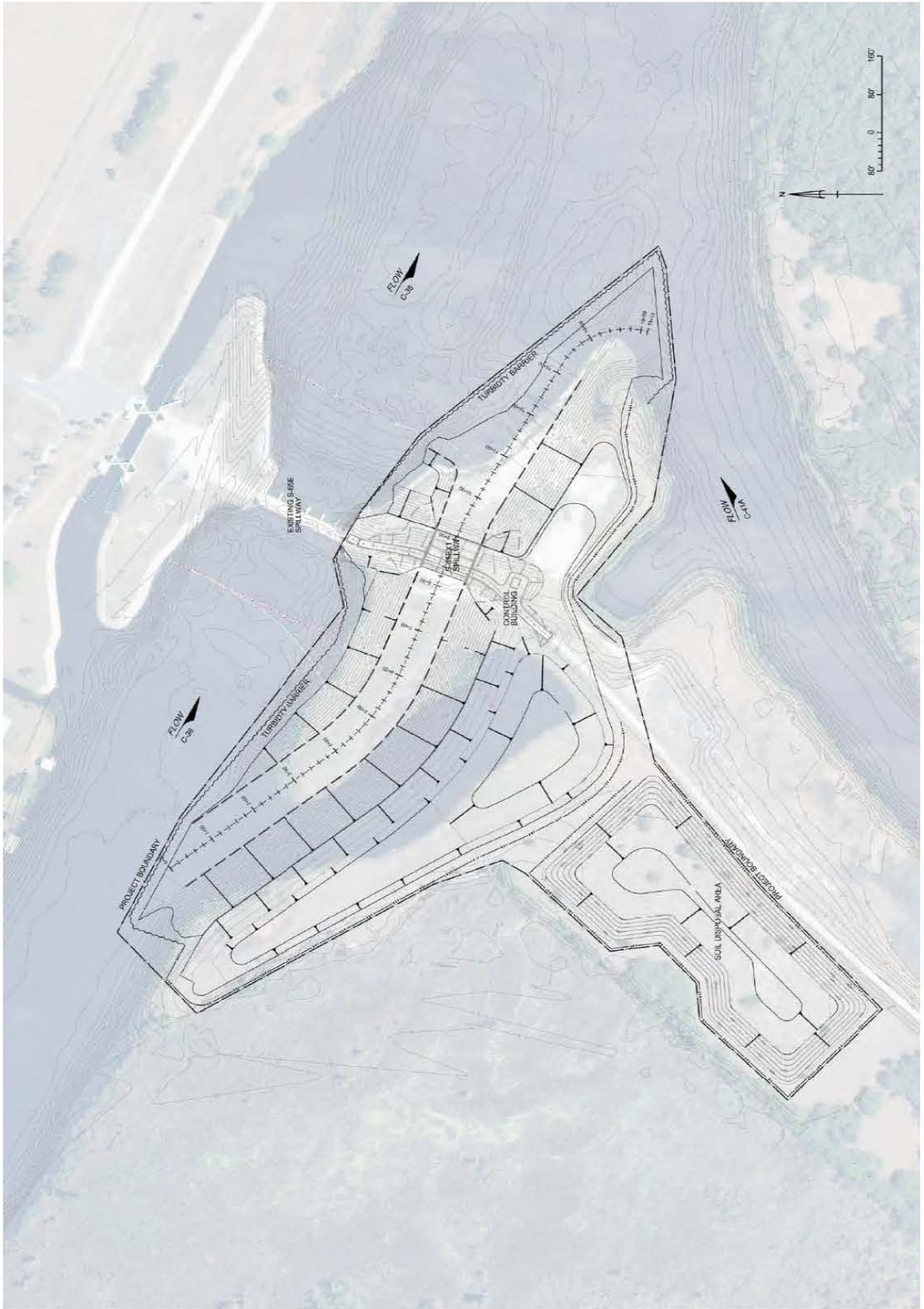
Figure 2.3. Project Site Plan Including Location of New Structure And New Channel Alignment.