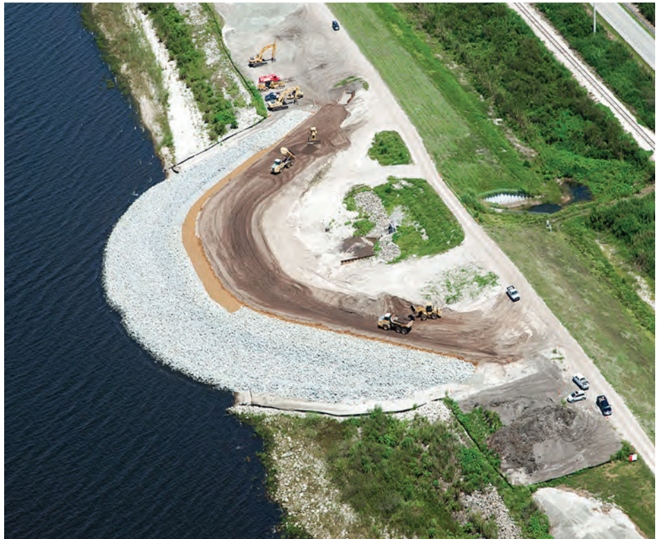
A temporary dam is constructed in advance of the removal of Culvert #14 near Port Mayaca. The culvert was removed in the fall of 2011.

As part of the federal culvert replacement program, the Corps will replace or remove 32 culverts within the HHD system. Work began in late 2011, with the removal of Culvert 14 north of Canal Point. Additional work began in 2012 to replace Culverts 11 and 16 south of Port Mayaca, and Culverts 1 and 1A east of Moore Haven. Contracts for the replacement of Culverts 3 and 4A near South Bay are expected to be awarded in the fall. The Corps anticipates removing or replacing all the culverts with construction continuing through 2018.