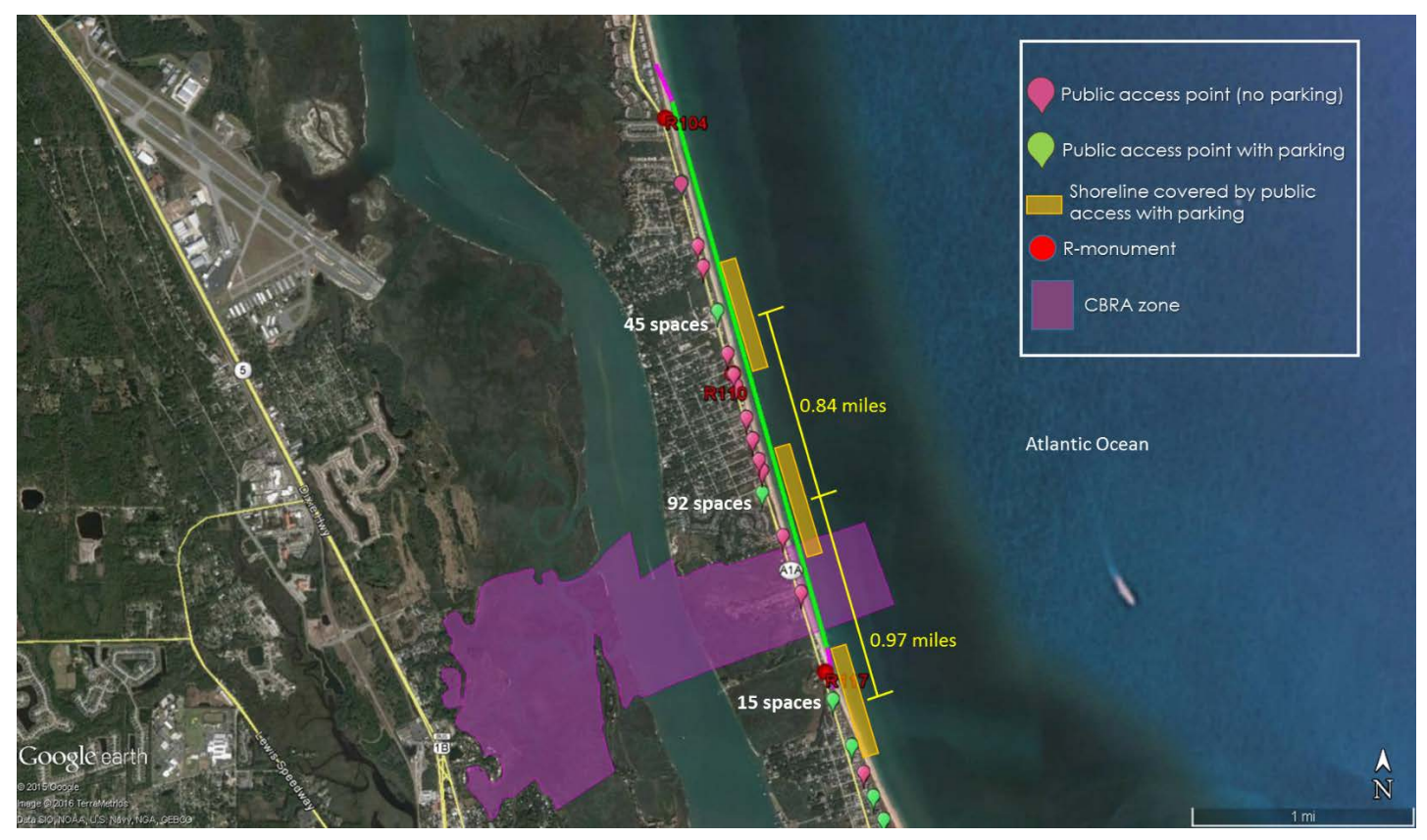
Figure 1: Shoreline image for subject area depicting FDEP R-monuments and public access points.

There are no federally owned lands in the subject segment. In the southern portion of the subject area there are 22 parcels that are located within a Coastal Barrier Resources Act (CBRA) zone, totaling approximately 2,190 feet. CBRA zones were developed as part of the Coastal Barrier Resources Act of 1982 along the Atlantic and Gulf coasts to encourage the conservation of hurricane prone, biologically rich coastal barriers by restricting federal expenditures that encourage development, such as federal flood insurance. CBRA zones are not cost-shared, and therefore the costs associated with these areas are covered 100% by the non-federal sponsor.