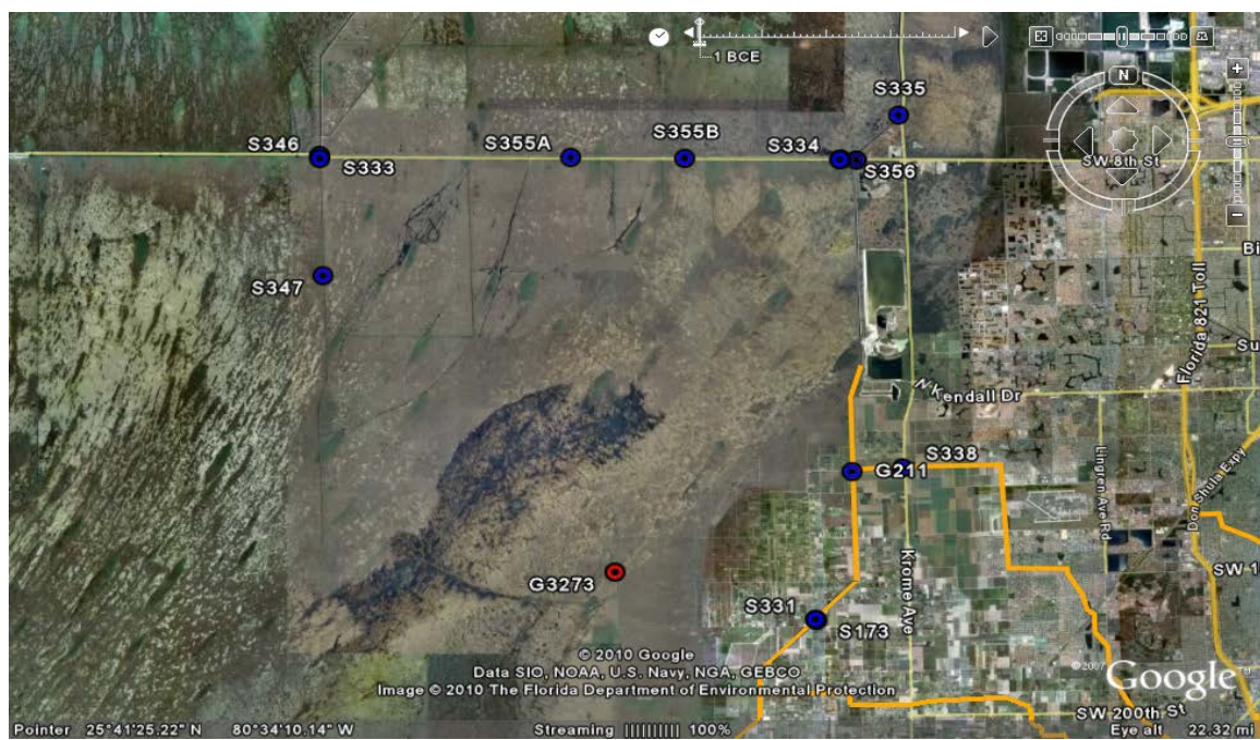
Figure 1. Location map showing the approximate location of G-3273.