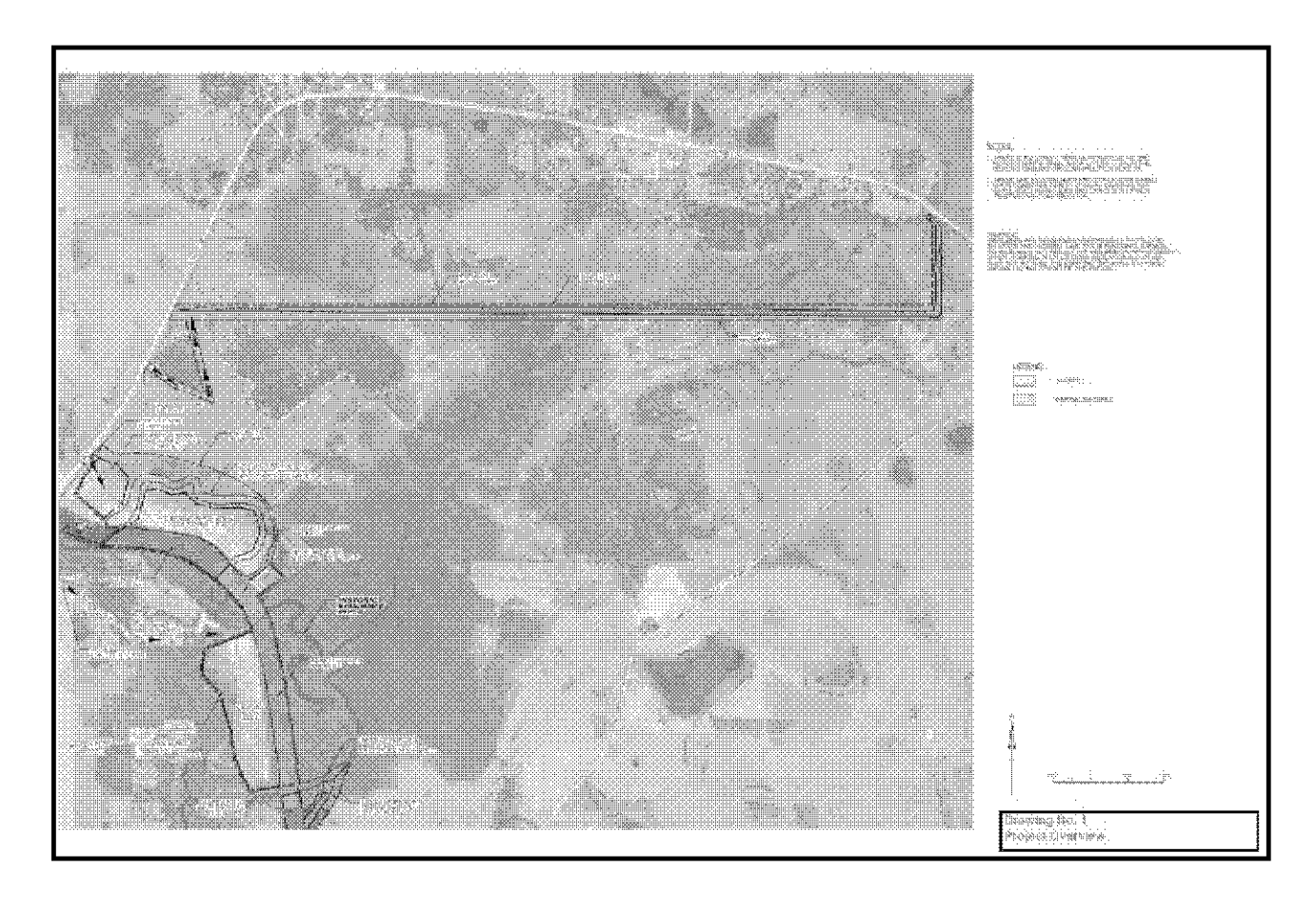
Figure 2. Plan view drawing of the Bass Levee to be degraded and the Backfill in Reach 3 of the C-38 canal.