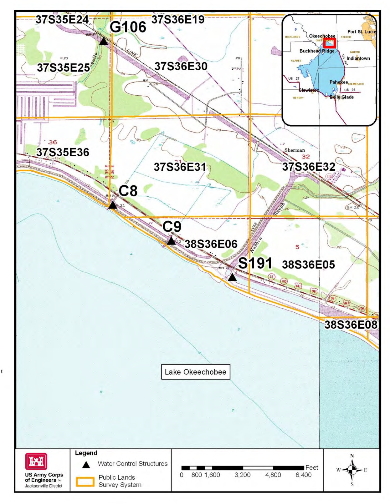
Figure 2: Location of Culvert 9 (C9).

Project:Herbert Hoover Dike RehabilitationSubject:Exemption for Construction ActivitiesPermit No.:0234604-016Page 7 of 9