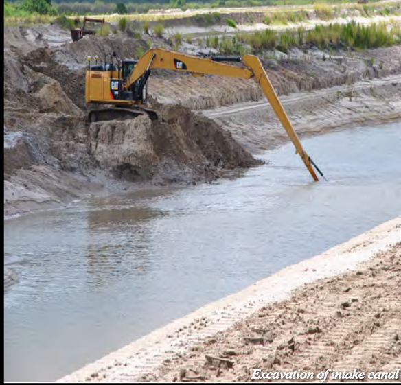
Excavation of intake canal