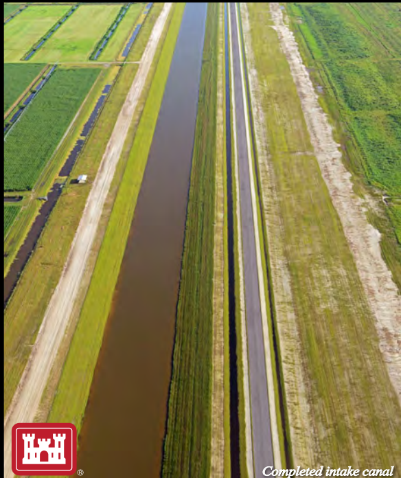
Completed intake canal