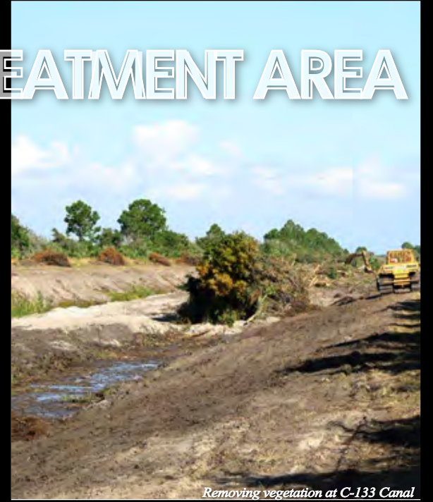
Removing vegetation at C-133 Canal