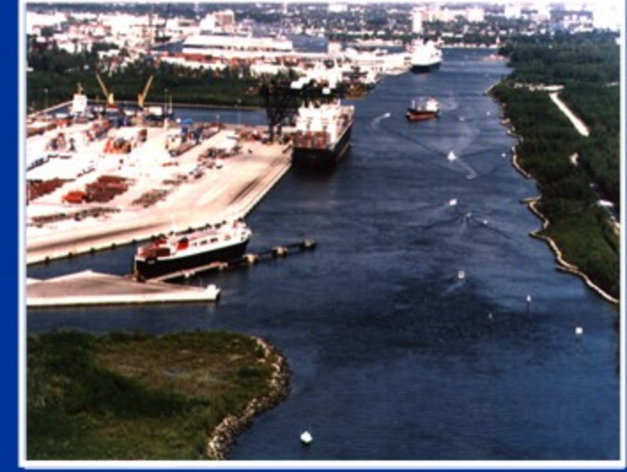
Port Everglades Harbor