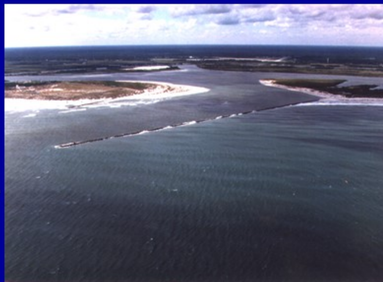
Ponce de Leon Inlet