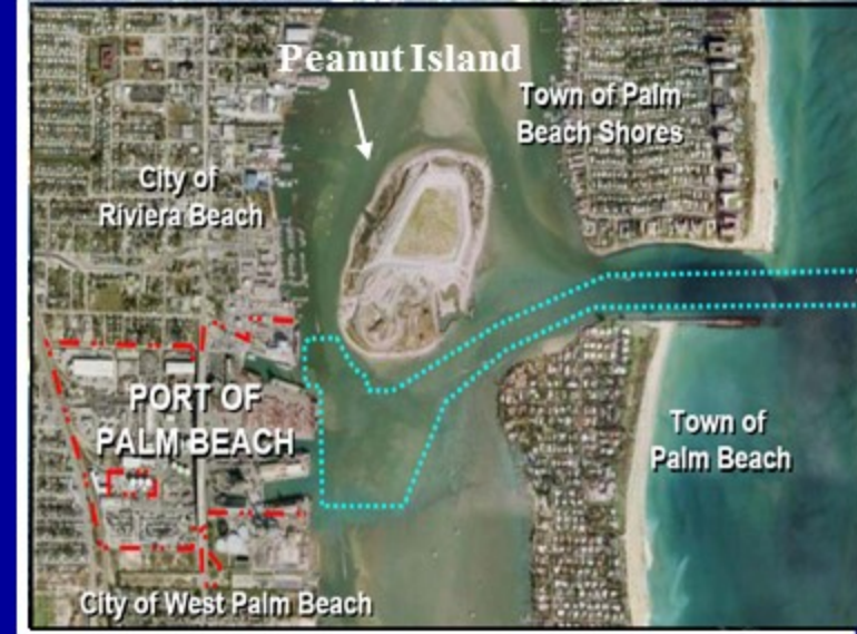
Palm Beach Harbor